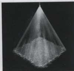
Full Cone 60° (N)