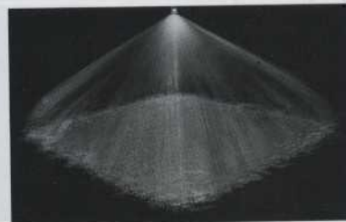
Full Cone 120° (W)